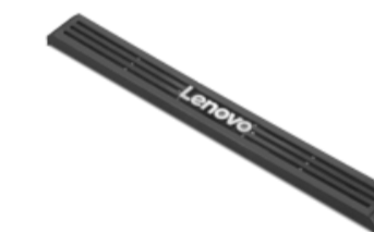
ThinkCentre Tiny Dust Shield Gen6