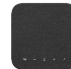
Lenovo Wireless Speakerphone 6000