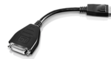
DisplayPort to Single-Link DVI-D (Digital) Monitor Adapter Cable II