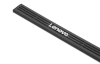
ThinkCentre Tiny Dust Shield Gen6 4XH1U87485