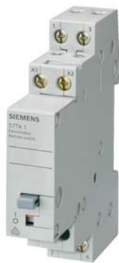
Remote control switch with 2 NO contacts, Contact for 230 V AC, 400V 16A Control 24 V DC