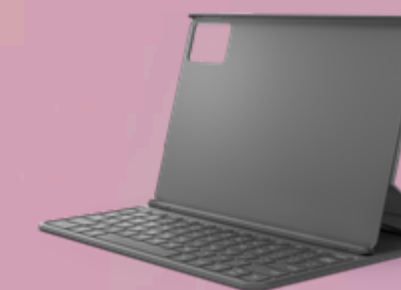
Lenovo Folio Keyboard for IdeaTab ZG38C07087