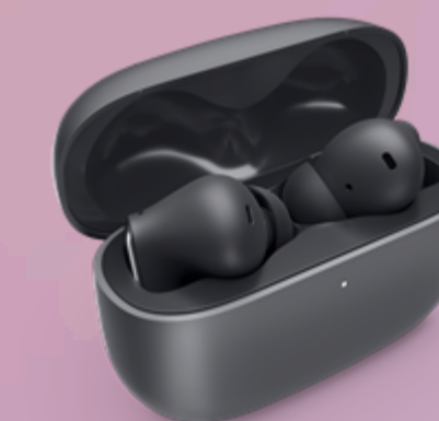
Lenovo TWS Earbuds (X9 Edition)-NA Version 4XD1S14145