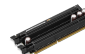
ThinkStation PCIe x16 to 2 PCIe x8 Riser Card