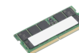
ThinkStation 48GB DDR5 6400MT/s ECC CSODIMM Memory