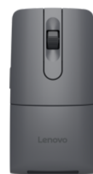
ThinkPad Bluetooth Presenter Mouse (Aura Edition)