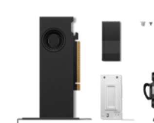
NVIDIA RTX PRO 2000 Blackwell 16GB mini DP*4 GDDR7 Graphics Card