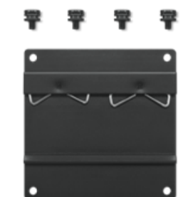
ThinkEdge SE50 DIN Rail Mount 4XF1C98168