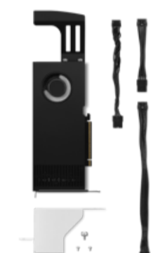
NVIDIA RTX PRO 4000 Blackwell 24GB DP*4 GDDR7 Graphics Card