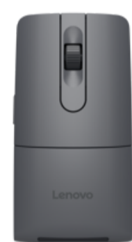
ThinkPad Bluetooth Presenter Mouse (Aura Edition)