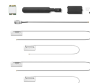
Intel Wi-Fi 7 BE200 WLAN Module