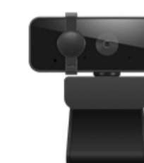
Lenovo 310 FHD Webcam Black