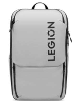
Lenovo Legion 17" Gaming Backpack GB800 (Light Gray)