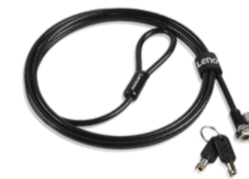
Kensington MicroSaver DS 2.0 Cable Lock from Lenovo