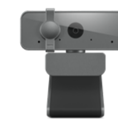
Lenovo Select FHD Webcam Gen2