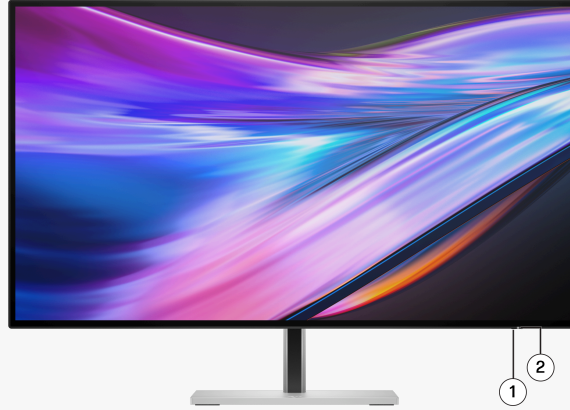
1. Power button