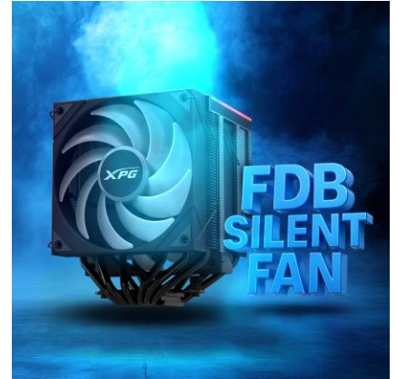
Efficient Cooling Under 22dB(A) in Avg.