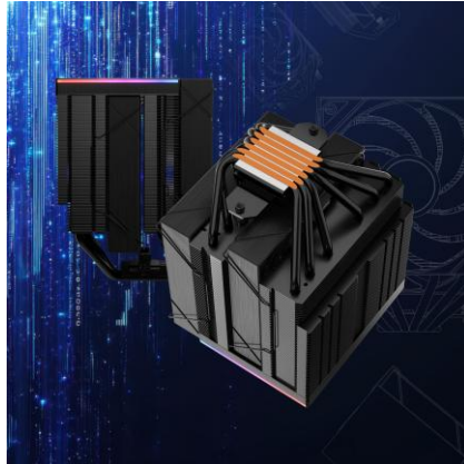
Dual Tower Design with 6 Heat Pipes