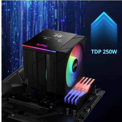
250W TDP to Unleash Full Performance