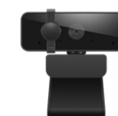
Lenovo 310 FHD Webcam Black