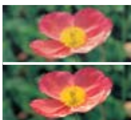
Lower resolution printout