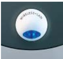
Print, fax, scan and copy wirelessly 1

Print your favourite photos in A4 or 4" x 6" borderless format using HP Colourfast Glossy Photo Paper. And with the optional 6-ink colour 4 printing, your photos will be fade resistant for up to 73 years 6 .