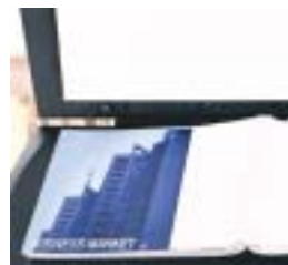
Versatile flatbed scanning