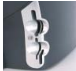
Multi-slot memory card reader 2