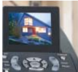
2.5" colour image LCD