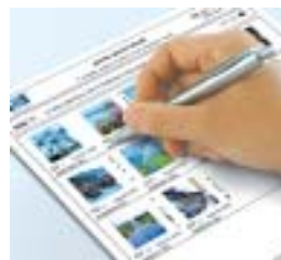
HP Photo Proof Sheet