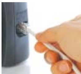
Plug-and-play Ethernet network connection