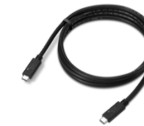
Lenovo USB 20Gbps USB-C to USB-C Cable 1.5m