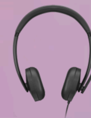
Lenovo Wired VoIP Headset 5000 4XD1R88995

Please click here to view the full list of accessories.