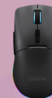
Lenovo Legion M220 Wireless RGB Gaming Mouse GY51U28359