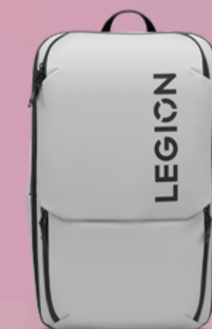
Lenovo Legion 17" Gaming Backpack GB800 (Light Gray) GX41U39300