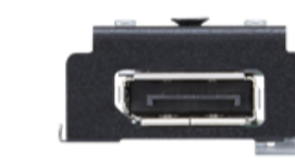
ThinkCentre Tiny DP Expansion Card with BTB Connector