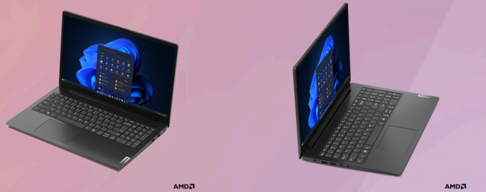
The product images are for illustration purposes only. Actual product appearance, ports, keyboard layout, and accessories may vary by model.