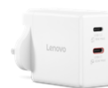
Lenovo Dual USB-C 65W GaN Charger