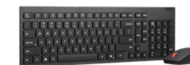
Lenovo Essential Wireless Combo Keyboard & Mouse Gen2 Black-UK English