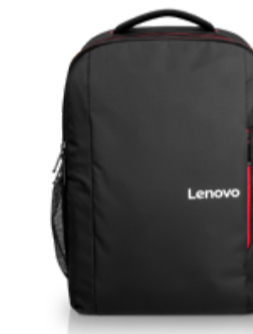
Lenovo 16" Laptop Everyday Backpack B510