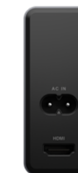
Lenovo Charging GaN Dock