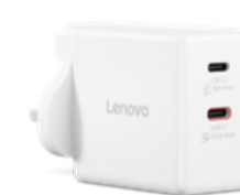
Lenovo Dual USB-C 65W GaN Charger