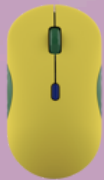
Lenovo 350 Bluetooth Silent Mouse (Fan Edition - Brazil) GY51U71760

Please click here to view the full list of accessories.