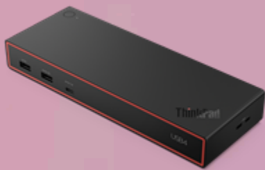
ThinkPad USB4 Dock 5000 40BF0100EU