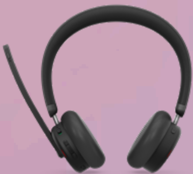
Lenovo Dual-Mode Wireless ANC Headset 6550 (USB-C, Teams) 4XD1S19778