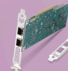
Intel E810-DA2 10/25GbE SFP28 2-Port PCIe Ethernet Adapter 4XC1U87489

Please click here to view the full list of accessories.