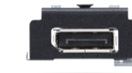
ThinkCentre Tiny DP Expansion Card with BTB Connector