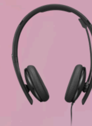
Lenovo Wired VoIP Headset (Teams) 4XD1M45626