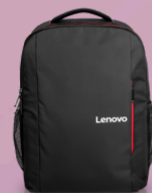
Lenovo 15.6 Laptop Everyday Backpack B510-ROW 4X41U80414

Please click here to view the full list of accessories.