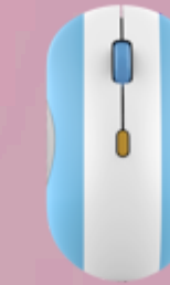
Lenovo 350 Bluetooth Silent Mouse (Fan Edition - Argentina) GY51U71763