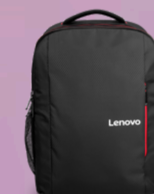
Lenovo 16" Laptop Everyday Backpack B510 4X41U80414

Please click here to view the full list of accessories.