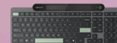
Lenovo Self-Charging Bluetooth Keyboard-French Canadian 058 4Y41R69498

Please click here to view the full list of accessories.