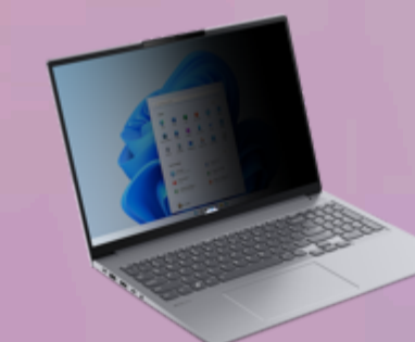
Lenovo 16-inch Premium Clarity Privacy Filter for ThinkBook 16 Gen 4 (16:10) 4XJ1U03940

Please click here to view the full list of accessories.