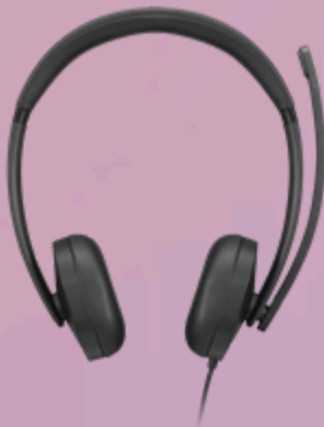
Lenovo Wired VoIP Headset 5000 4XD1R88995