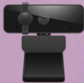
Lenovo Essential FHD Webcam Gen2 4XC1S15018

Please click here to view the full list of accessories.