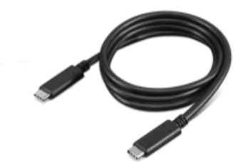
Lenovo USB-C Cable 1m