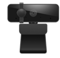
Lenovo 310 FHD Webcam Black GXC1S15024