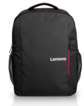
Lenovo 16" Laptop Everyday Backpack B510 4X41U80414