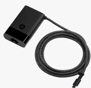
HP USB-C 65W Laptop Charger 671R2AA