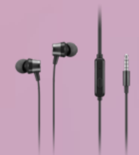
Lenovo Analog In-Ear Headphones Gen II Bulk Packag 4XD1T54899

Please click here to view the full list of accessories.