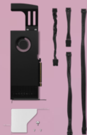
NVIDIA RTX PRO 4000 Blackwell 24GB DP*4 GDDR7 4X61T95636