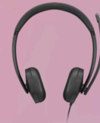
Lenovo Wired VoIP Headset 5000 (Teams) 4XD1R88995