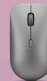
Lenovo Wireless Multi-Mode Pro Plus Mouse 6050 (Luna Grey) 4Y51S61878