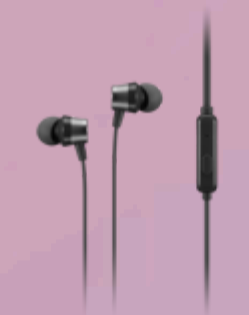
Lenovo Analog In-Ear Headphones Gen II Bulk Package (20pcs) 4XD1T54899