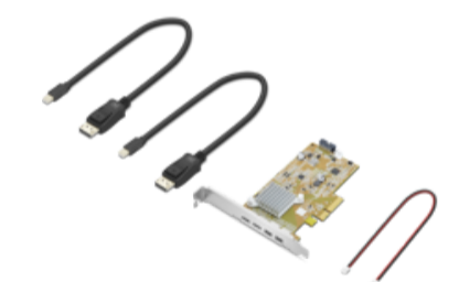
ThinkStation USB4 Dual Port PCIe Card