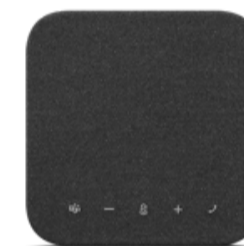
Lenovo Wireless Speakerphone 6000