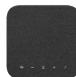
Lenovo Wireless Speakerphone 6000