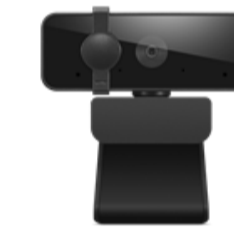
Lenovo Essential FHD Webcam Gen2