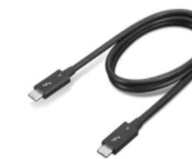
Lenovo Thunderbolt 4 Cable 0.7m