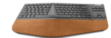
Lenovo Go Wireless Split Keyboard-US English