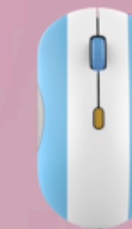
Lenovo 350 Bluetooth Silent Mouse (Fan Edition - Argentina) GY51U71763