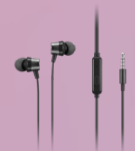
Lenovo Analog In-Ear Headphones Gen II Bulk Package 4XD1T54899

Please click here to view the full list of accessories.