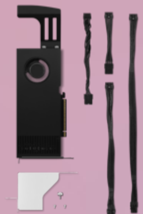
NVIDIA RTX PRO 4000 Blackwell 24GB DP*4 GDDR7 4X61T95636