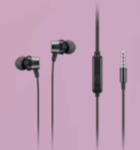
Lenovo Analog In-Ear Headphones Gen II Bulk Packag 4XD1T54899

Please click here to view the full list of accessories.