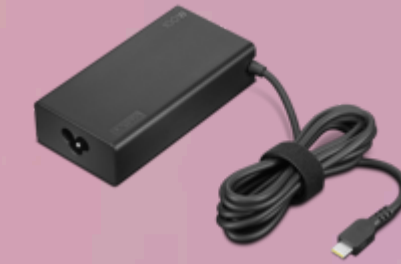
Lenovo USB-C 100W AC Adapter-DK GX21V60487