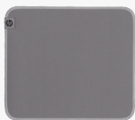
HP 100 Sanitizable Mouse Pad 8X594AA