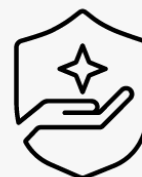
3-year pickup and return U4819E