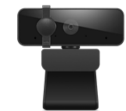
Lenovo 310 FHD Webcam Black