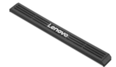
ThinkCentre Tiny Dust Shield Gen6