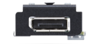
ThinkCentre Tiny DP Expansion Card with BTB Connector