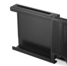
ThinkCentre Tiny Mounting Kit