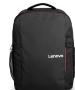
Lenovo 16" Laptop Everyday Backpack B510 4X41U80414