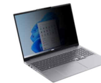
Lenovo 16" Clarity Privacy Filter 4XJ1U03940