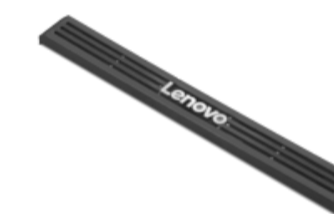
ThinkCentre Tiny Dust Shield Gen6