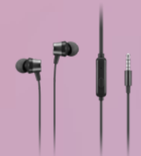
Lenovo Analog In-Ear Headphones Gen II Bulk Packag 4XD1T54899

Please click here to view the full list of accessories.